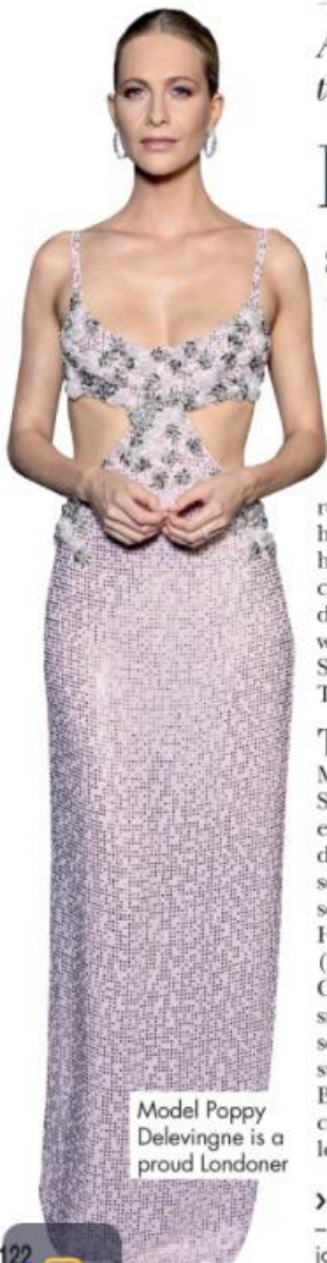
Model Poppy Delevingne is a proud Londoner