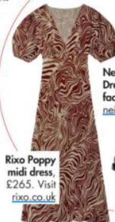
Rixo Poppy midi dress, £265. Visit rixa.co.uk