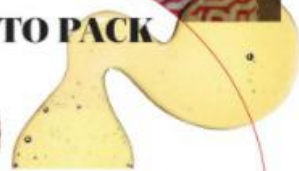
Neighbourhood Botanicals Dream Dream Dream night facial oil, £28. Visit neighbourhoodbotanicals.com