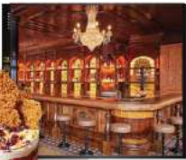
Whisky galore: the Cadogan Arms' three courses finish with a raspberry and whisky cranachan

menu ticks off with whisky-cured smoked salmon ahead of venison and haggis Wellington and Scottish raspberry and whisky cranachan. The menu price includes two whisky cocktails and a dram of single malt. How much? Three courses, £75