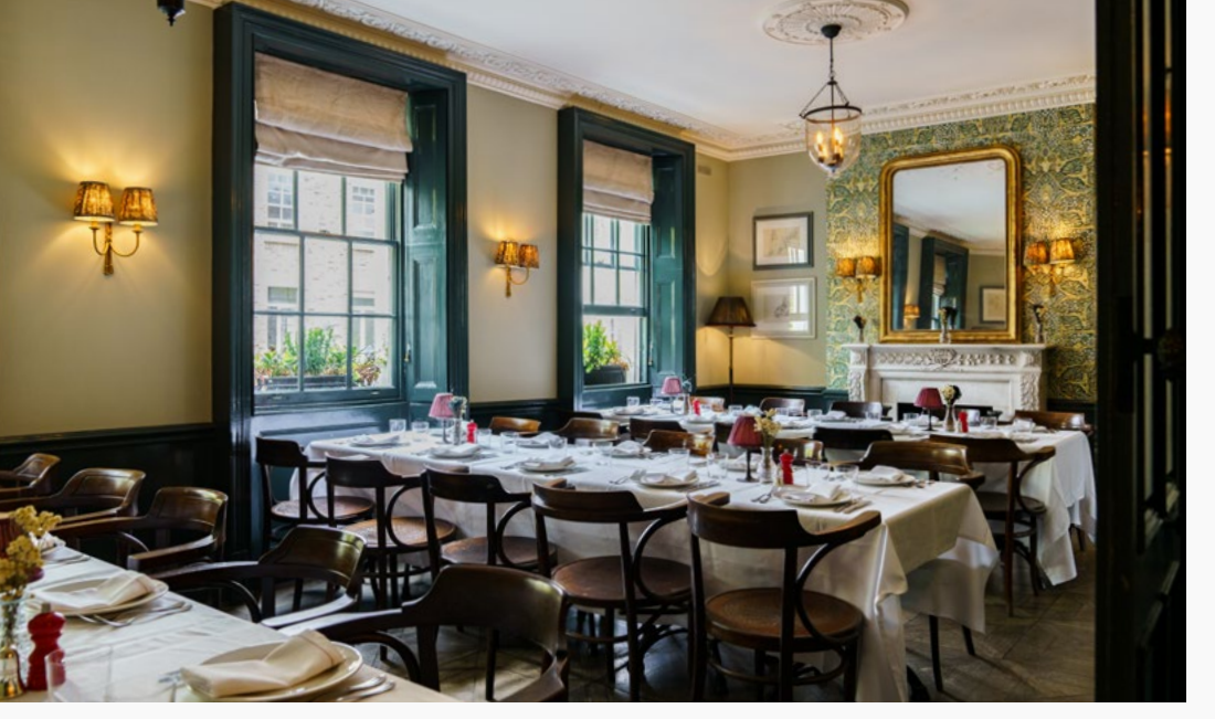
The Main Dining Room