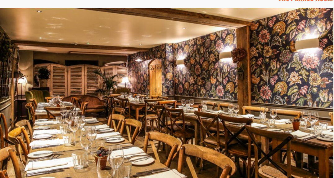
The Pimlico Room