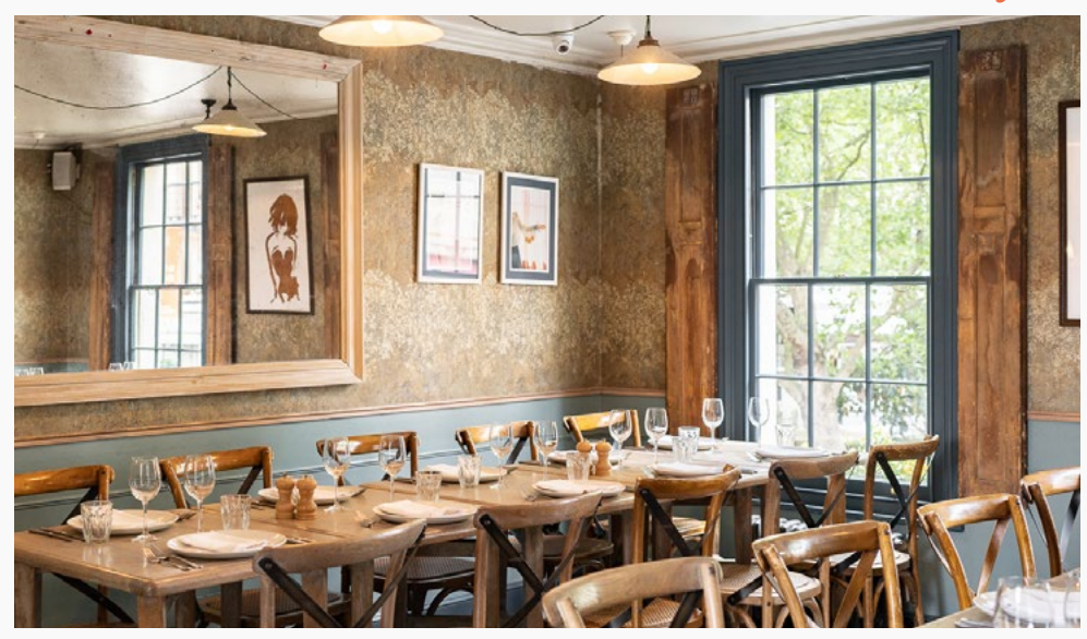
The Ebury Room