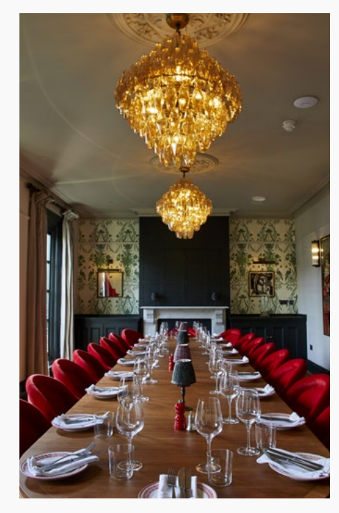
The Victoria Room