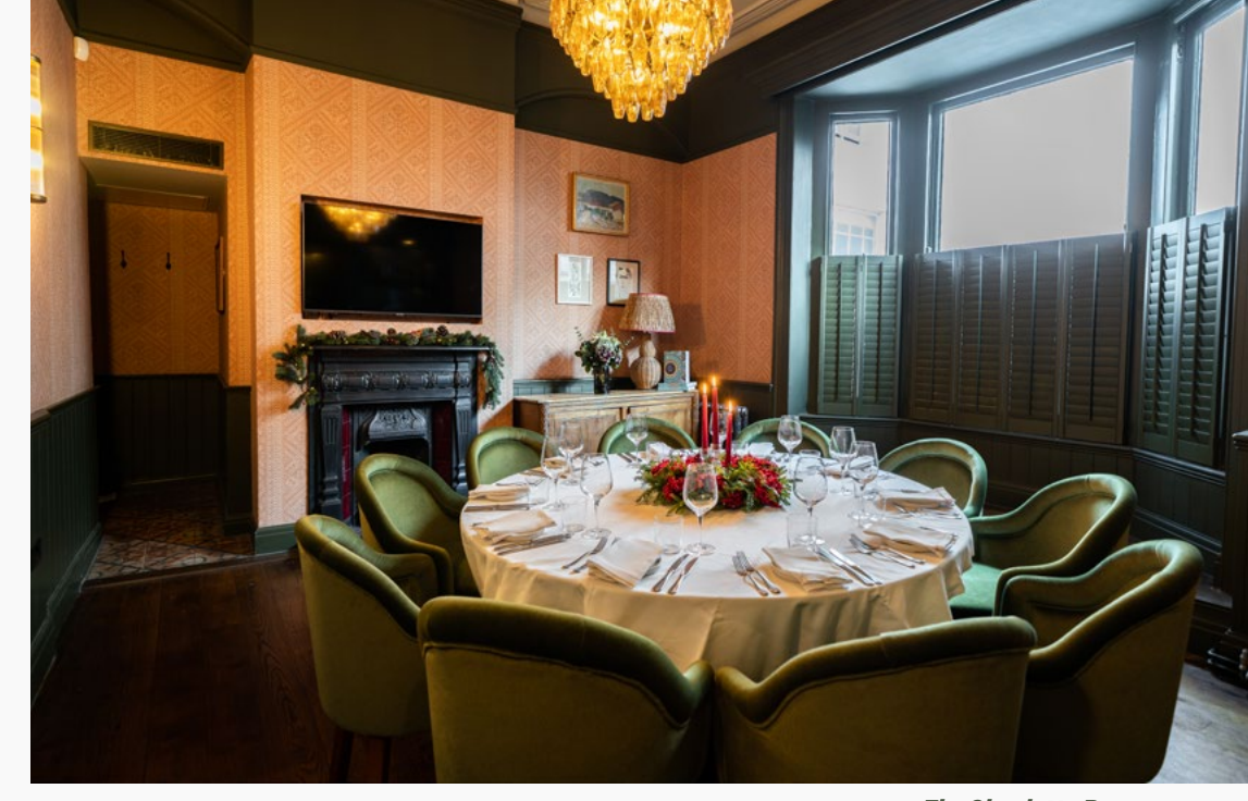
The Charlotte Room