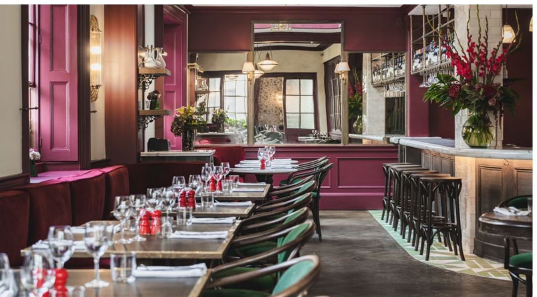
The Back Dining Room