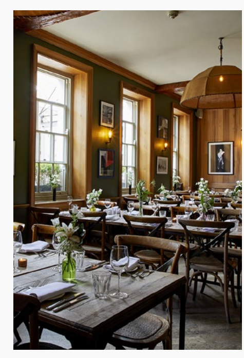
The Front Dining Room