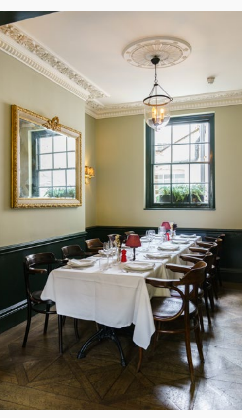
The Small Dining Room