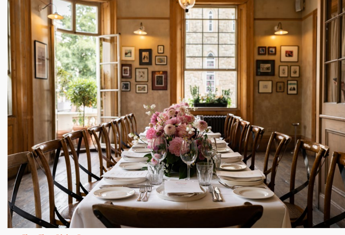
First Floor Dining Room