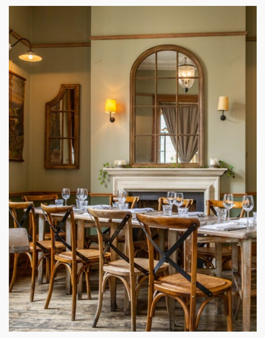
St. Barnanus Room (First Floor)