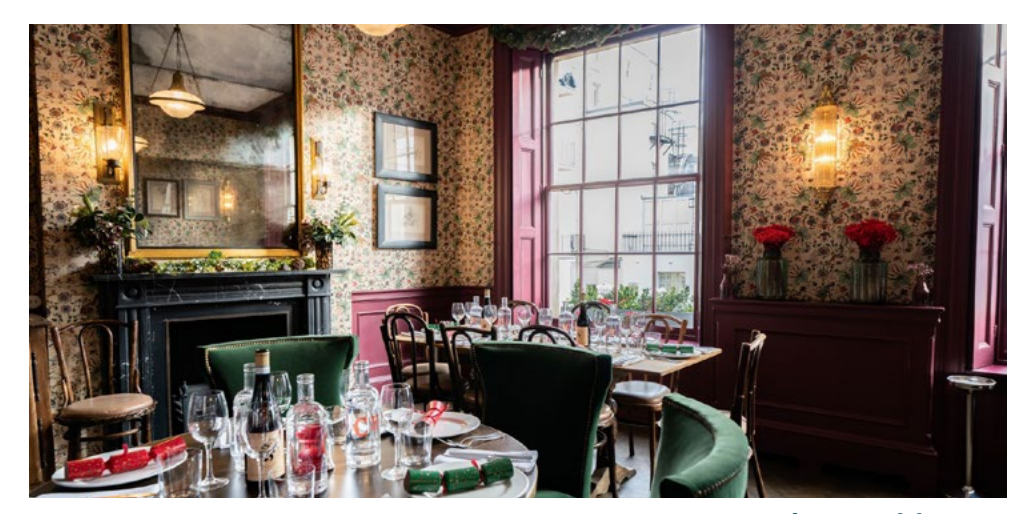
The Front Dining Room