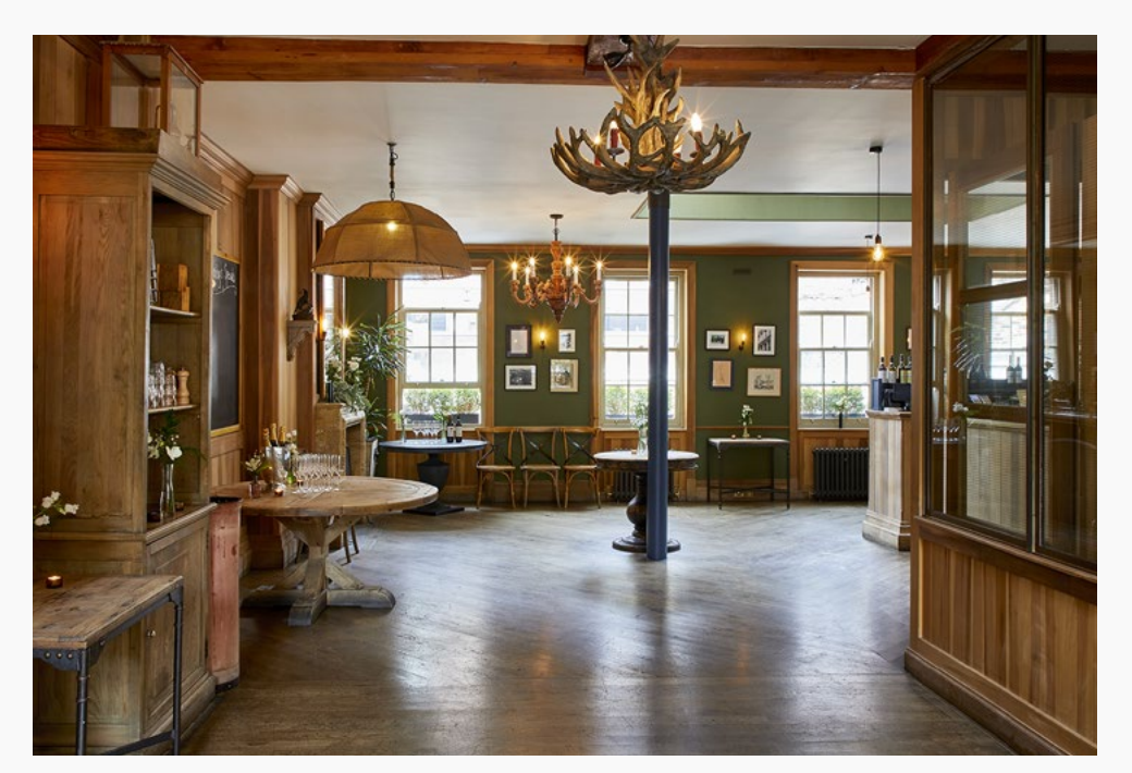
The First Floor Restaurant Exclusive