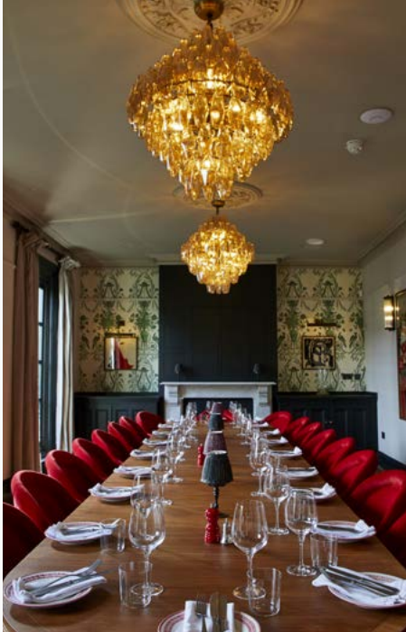
The Victoria Room