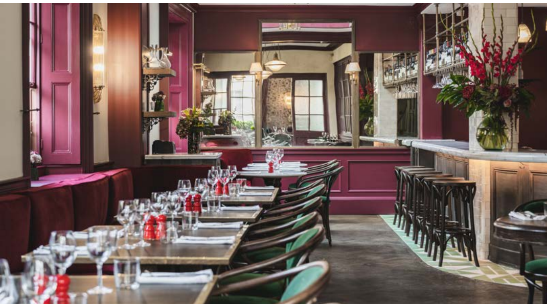
The Back Dining Room