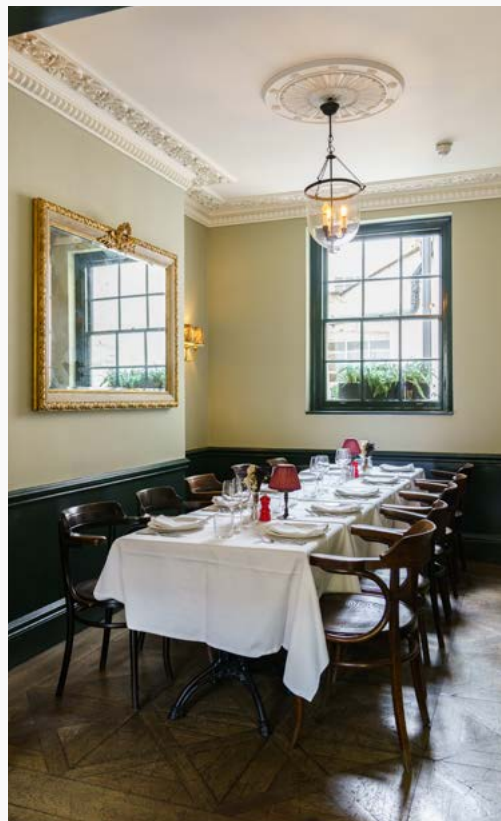
The Small Dining Room