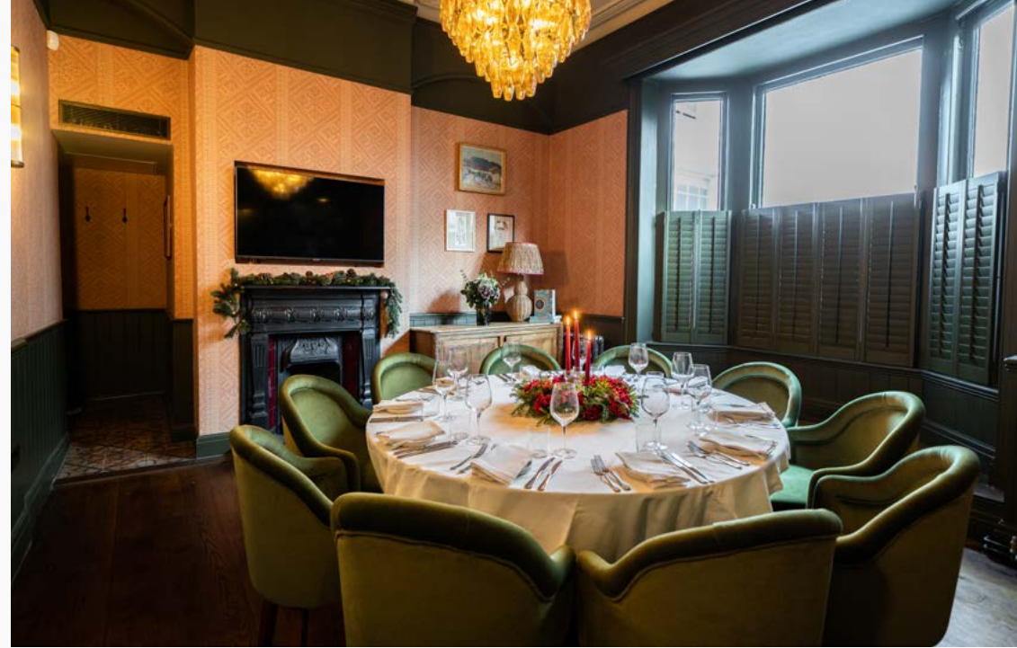
The Charlotte Room