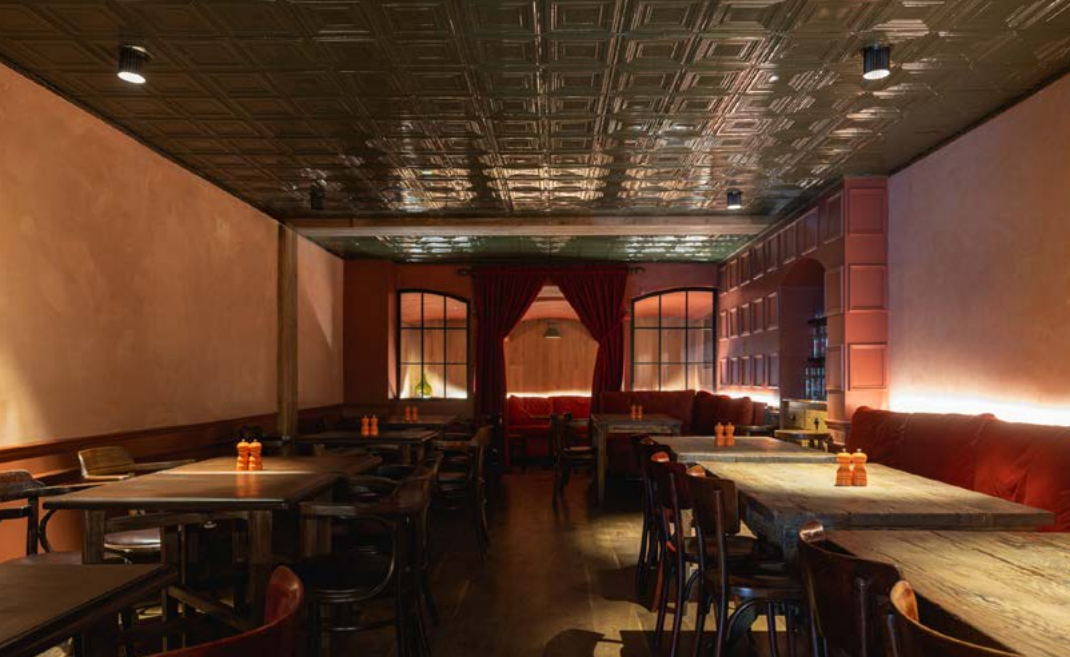
The Blood Orange Bar