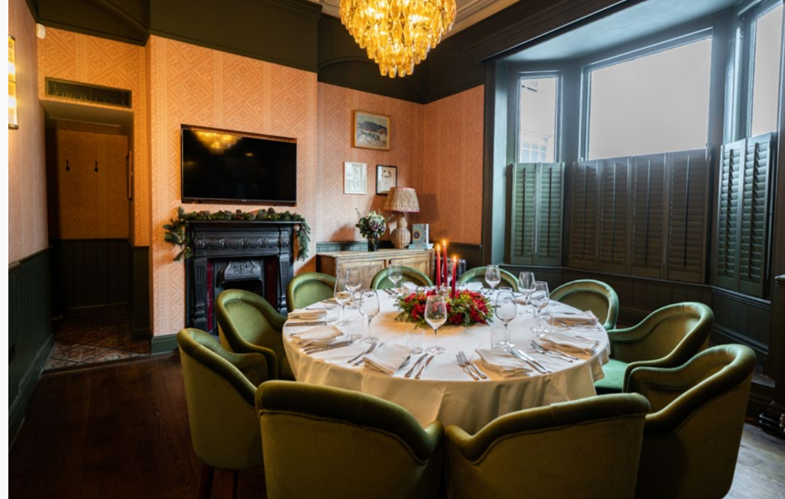
The Charlotte Room