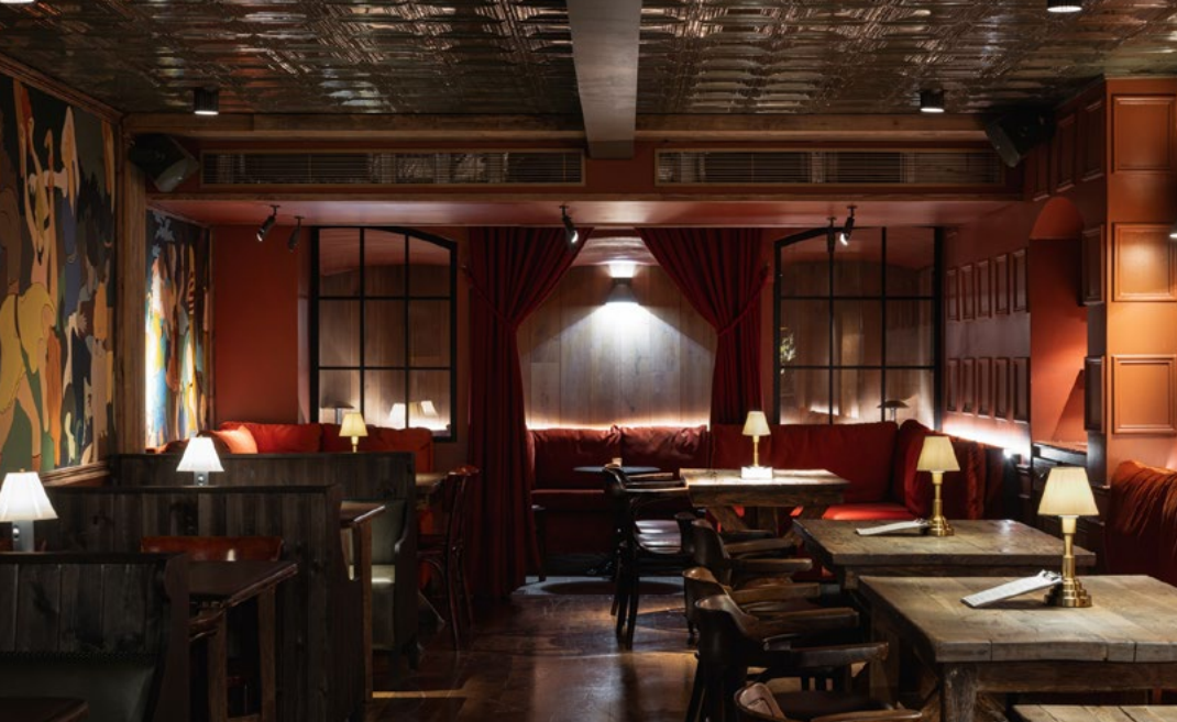
The Blood Orange Bar