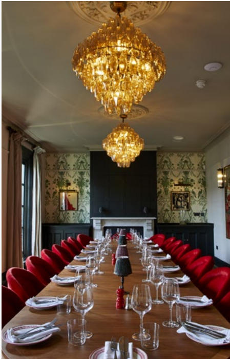
The Victoria Room