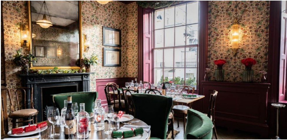
The Front Dining Room