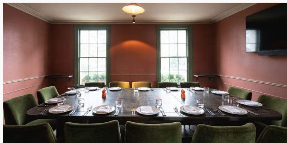
The Feasting Room