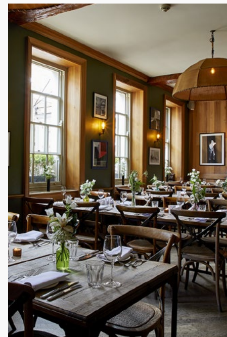
The Front Dining Room