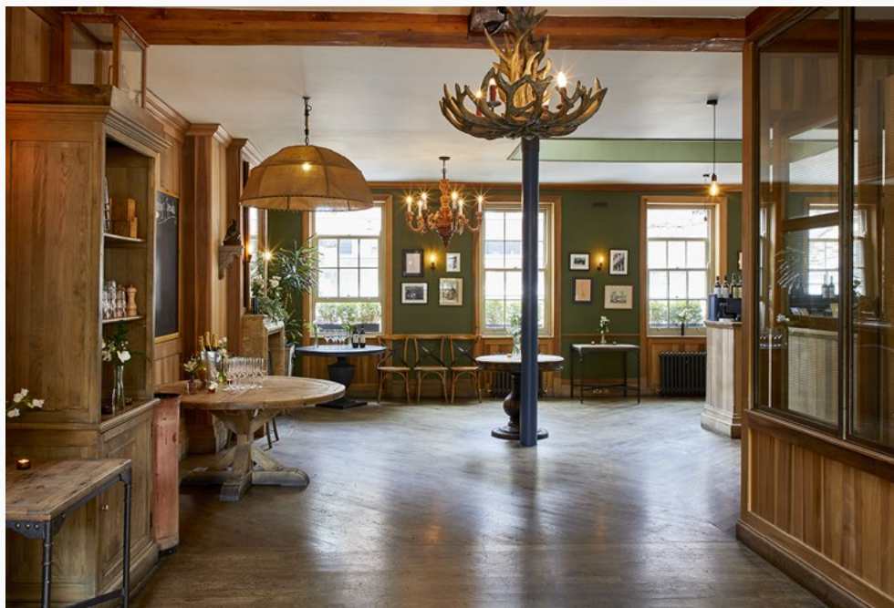
The First Floor Restaurant Exclusive