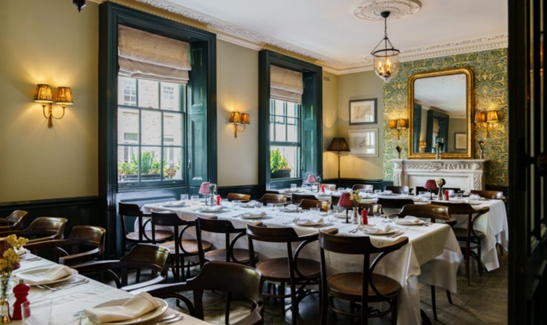
The Main Dining Room