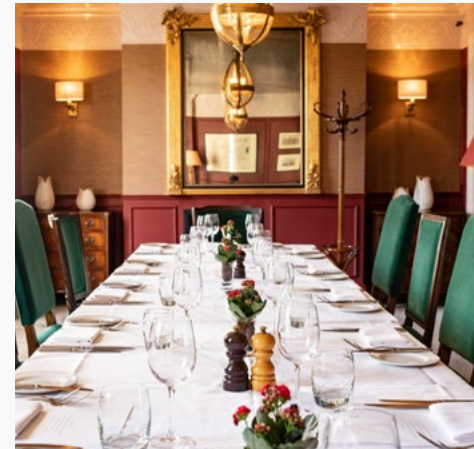
The Drawing Room