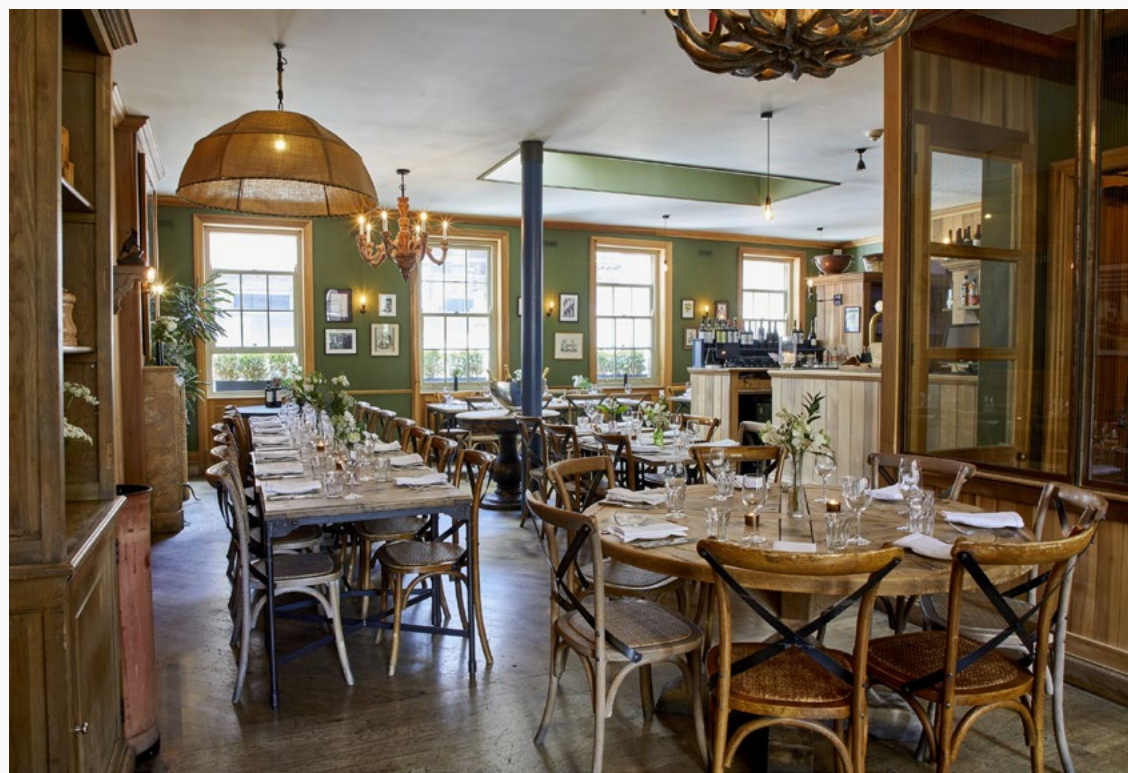
The Back Dining Room