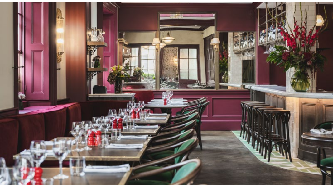
The Back Dining Room