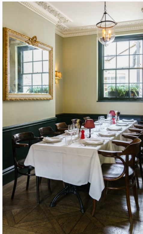
The Small Dining Room