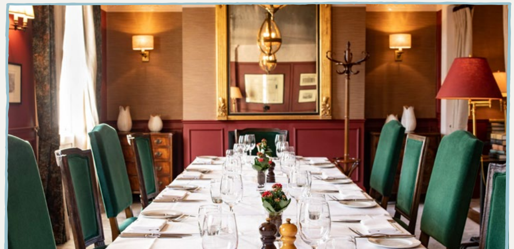
The Small Dining Room