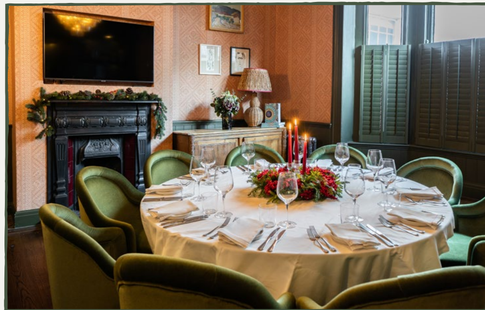
The Charlotte Room