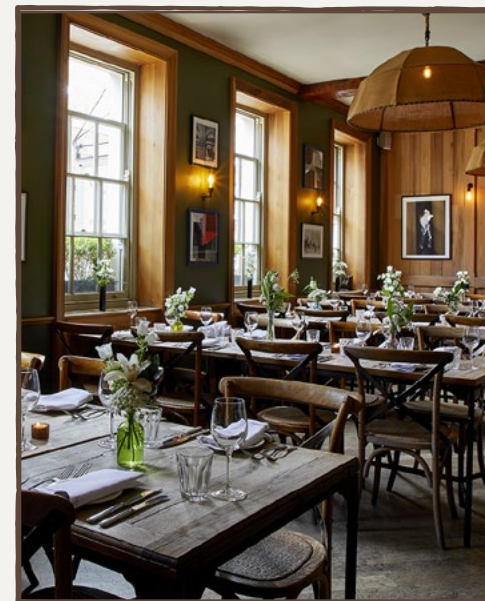
The Front Dining Room