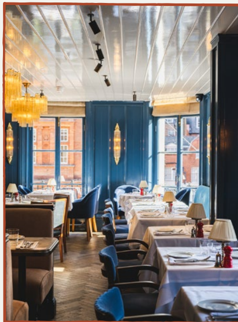
First Floor Exclusive