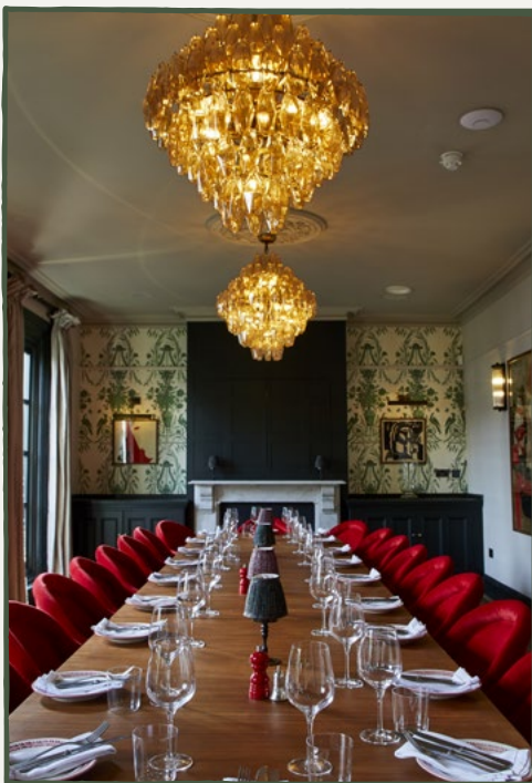
The Victoria Room