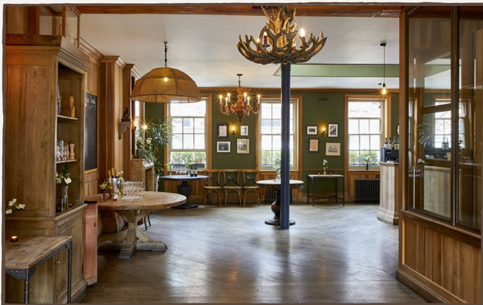
The First Floor Restaurant Exclusive