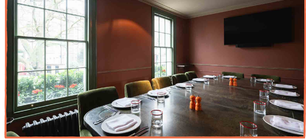
The Feasting Room